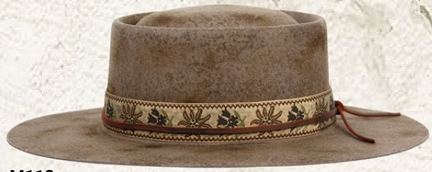
M118 One Size / Adjustable Drawstring 100% Australian Wool Felt