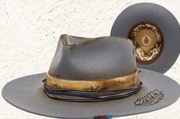
M6095 Size: M, L, XL 100% Australian Wool Felt