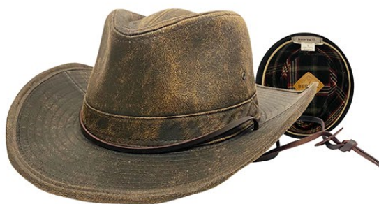
BER6089 Material: Wax Cotton S/M 2, L/XL 4