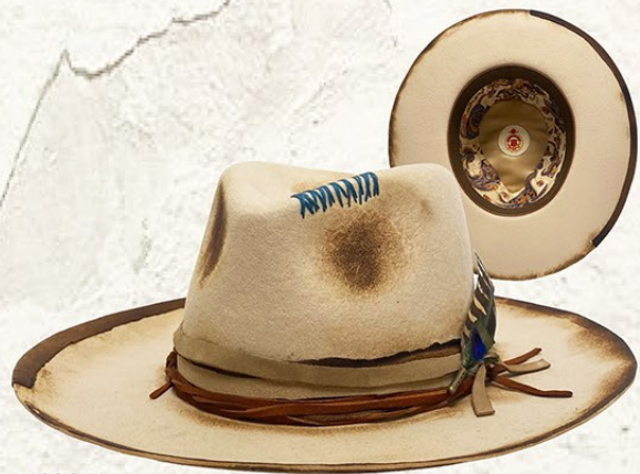
M6094 Size: M, L, XL 100% Australian Wool Felt