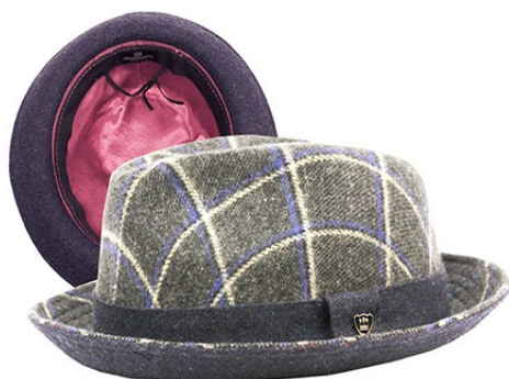
F5114 100% Wool S/M 3 L/XL 3