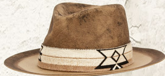
M109 One Size / Adjustable Drawstring 100% Australian Wool Felt