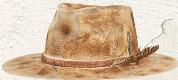
M112 One Size / Adjustable Drawstring 100% Australian Wool Felt