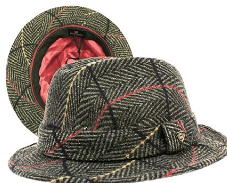
F5116 100% Wool S/M 3 L/XL 3