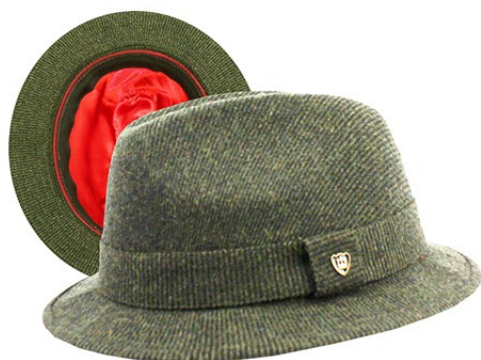
F5117 100% Wool S/M 3 L/XL 3