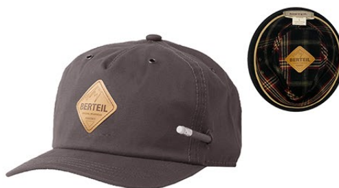
BER6084 Material: Oil Cotton M 2, L 2, XL 2