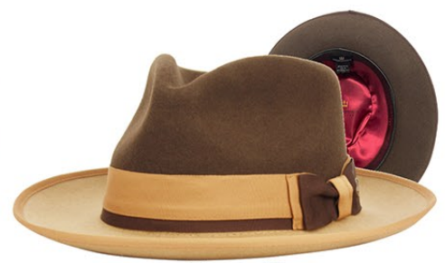
Brown / Tan