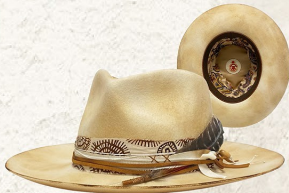
M6097 Size: M, L, XL 100% Australian Wool Felt