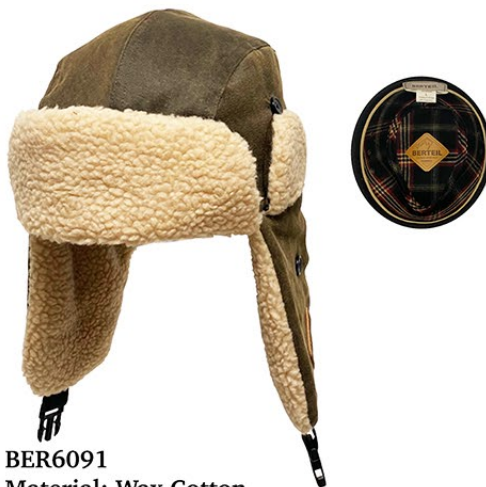
BER6091 Material: Wax Cotton One size