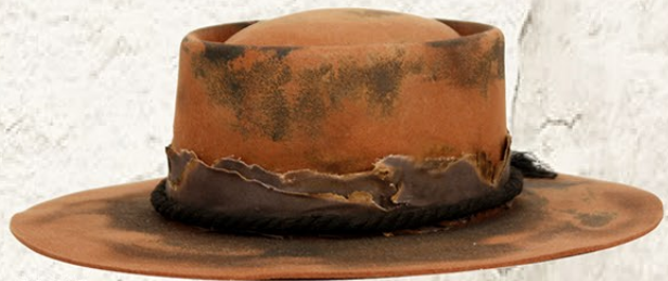
M117 One Size / Adjustable Drawstring 100% Australian Wool Felt