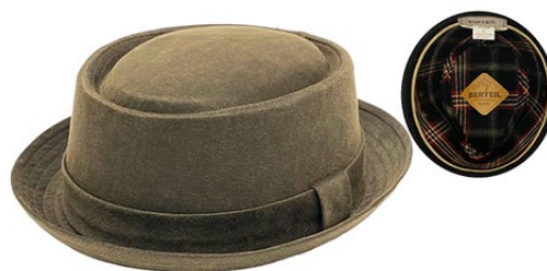
BER6090 Material: Wax Cotton S/M 2, L/XL 4