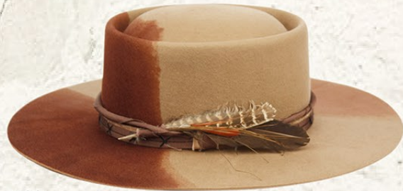
M90 One Size / Adjustable Drawstring 100% Australian Wool Felt