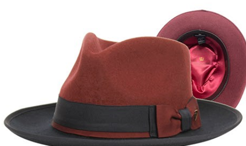
Burgundy / Navy