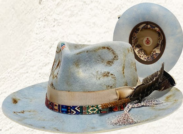
M6099 Size: M, L, XL 100% Australian Wool Felt