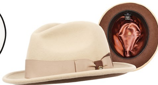
Tan / Brown