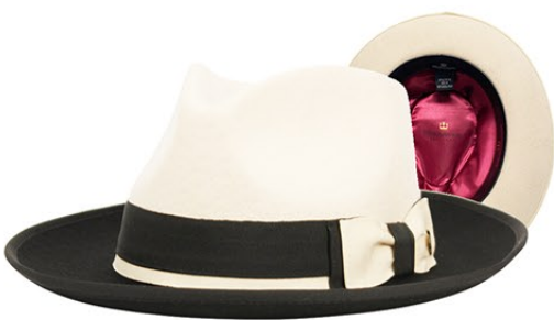
Beige / Black