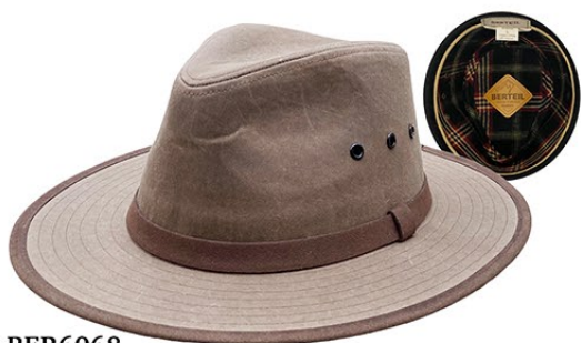
BER6068 Material: Oil Cotton M 2, L 2, XL 2