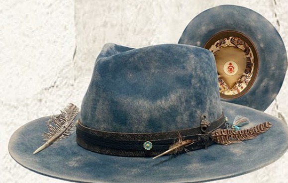
M6096 Size: M, L, XL 100% Australian Wool Felt