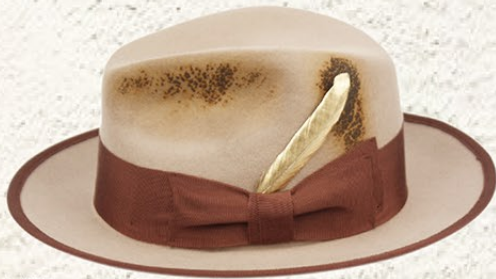
M97 One Size / Adjustable Drawstring 100% Australian Wool Felt