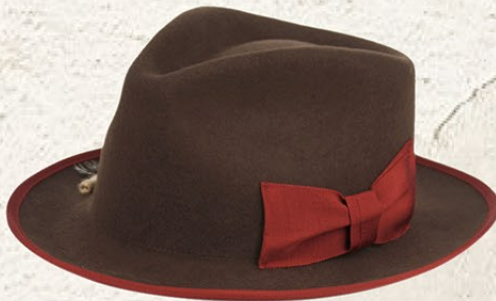
M96 One Size / Adjustable Drawstring 100% Australian Wool Felt