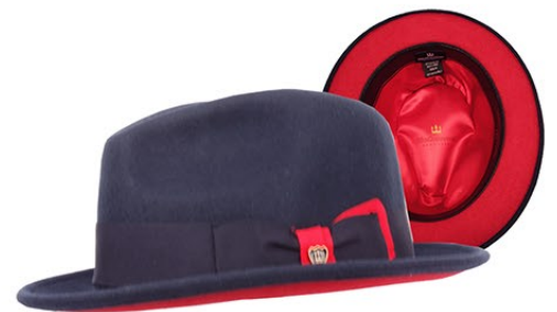
Navy / Red