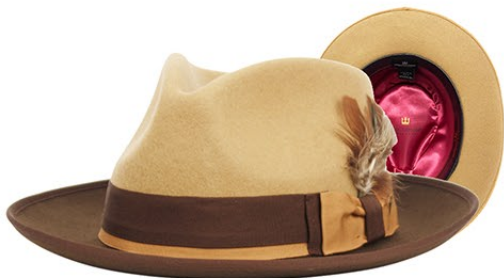
Tan / Brown