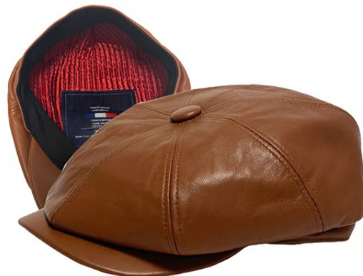
BER02 TAN Material: Genuine Leather Sold By Size M, L, XL