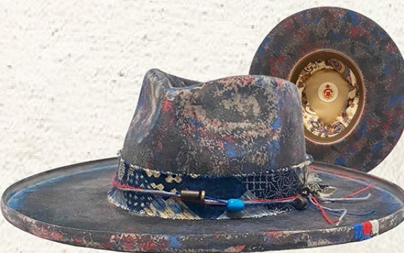
M6098 Size: M, L, XL 100% Australian Wool Felt