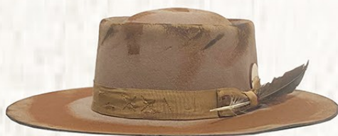
M104N One Size / Adjustable Drawstring 100% Australian Wool Felt

Overall, Morreton is a brand that has stood the test of time, thanks to its commitment to quality, craftsmanship, and innovation. Whether you're looking for a classic fedora, a trendy beret, or something in between, Morreton is sure to have the perfect hat to suit your style.