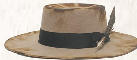
M92N One Size / Adjustable Drawstring 100% Australian Wool Felt