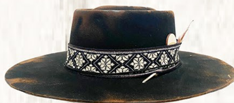
M91N One Size / Adjustable Drawstring 100% Australian Wool Felt