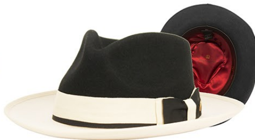
Black / Beige