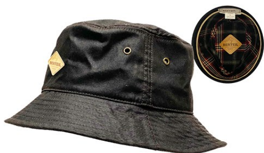
BER6083 Material: Oil Cotton M 2, L 2, XL 2