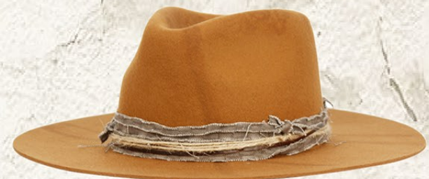
M114 One Size / Adjustable Drawstring 100% Australian Wool Felt