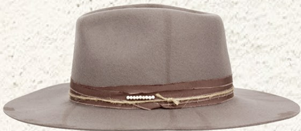
M111 One Size / Adjustable Drawstring 100% Australian Wool Felt