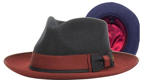
Navy / Burgundy