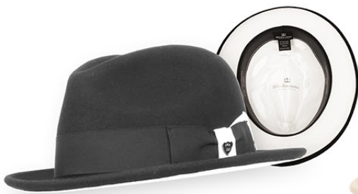
Black / Ivory