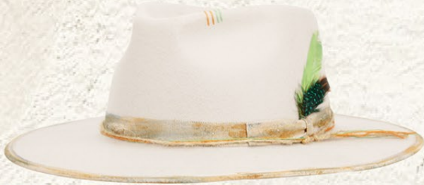
M115 One Size / Adjustable Drawstring 100% Australian Wool Felt