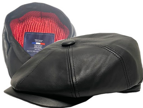
BER02 BLACK Material: Genuine Leather Sold By Size M, L, XL

Today, Berteil hats remain a representation of high quality, fashion, and classic style, becoming one of the precious heritages of the French traditional manufacturing industry.