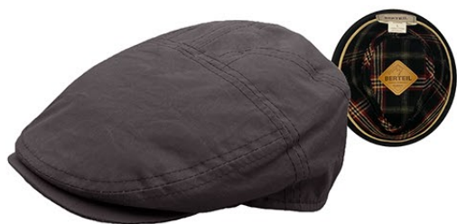
BER6082 Material: Oil Cotton M 2, L 2, XL 2