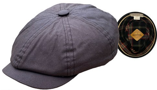
BER6067 Material: Oil Cotton M 2, L 2, XL 2