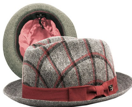
F5115 100% Wool S/M 3 L/XL 3