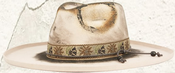
M116 One Size / Adjustable Drawstring 100% Australian Wool Felt