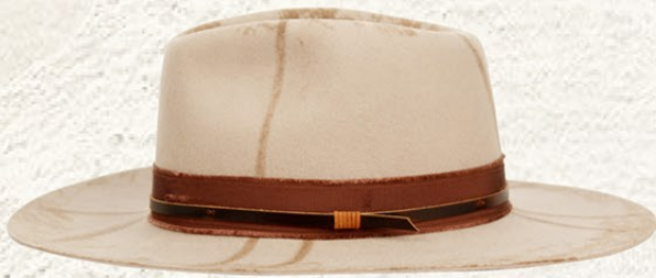
M110 One Size / Adjustable Drawstring 100% Australian Wool Felt